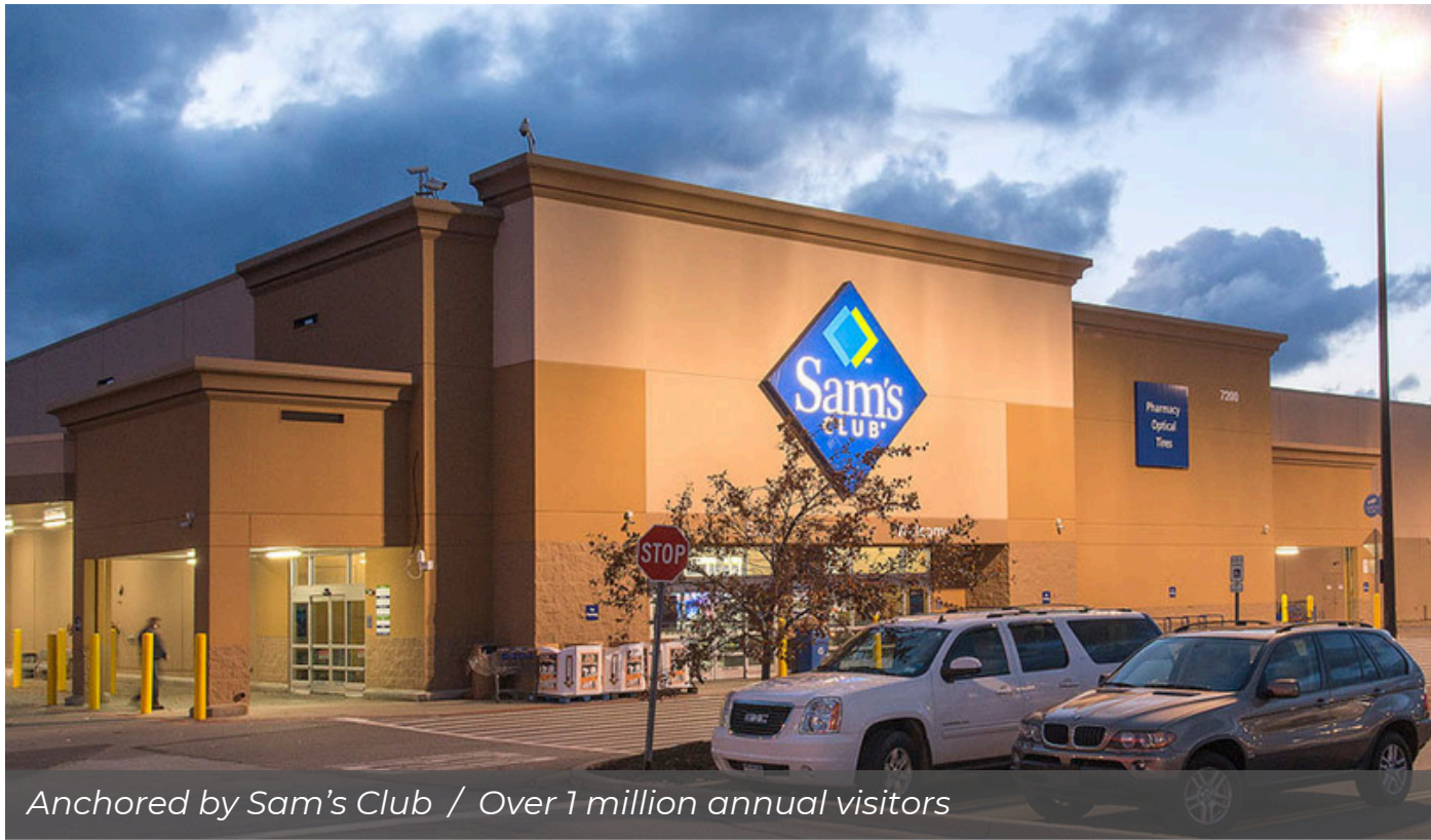
Anchored by Sam's Club / Over 1 million annual visitors