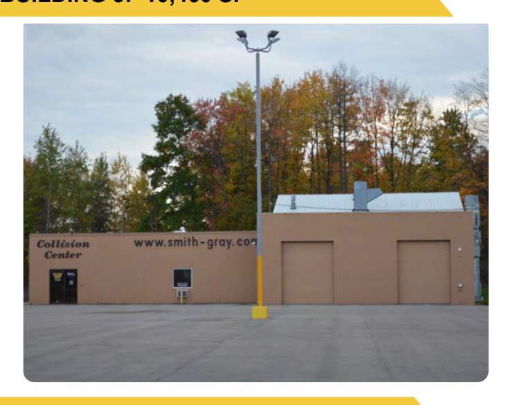
BUILDING 3: 10,460 SF