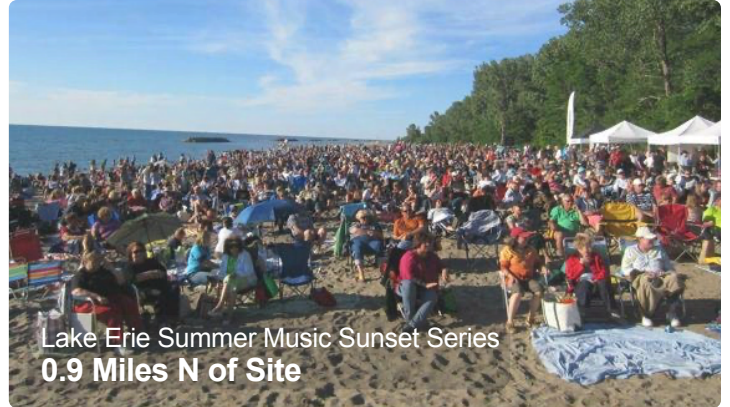
Lake Erie Summer Music Sunset Series 0.9 Miles N of Site