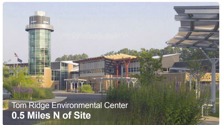
Tom Ridge Environmental Center 0.5 Miles N of Site

Baldwin Brothers, INC. 2540 Village Common Dr. Erie, PA 16506