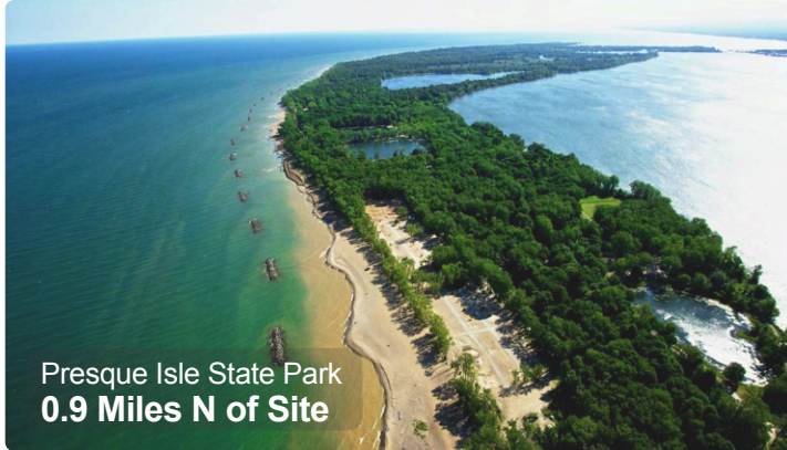
Presque Isle State Park 0.9 Miles N of Site